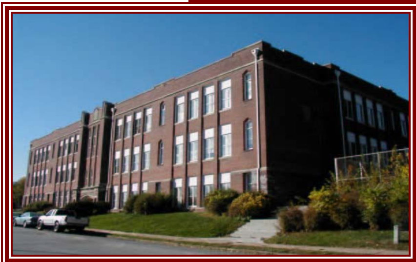
Park School Omaha, Nebraska