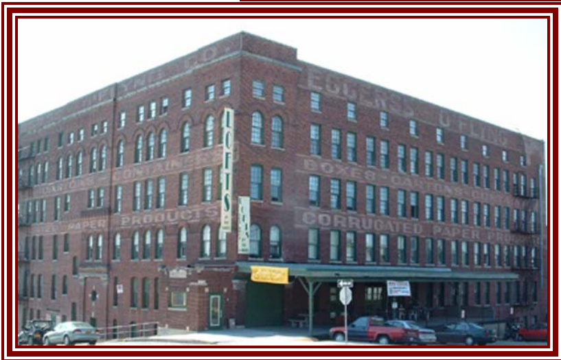
Leavenworth Lofts Omaha, Nebraska