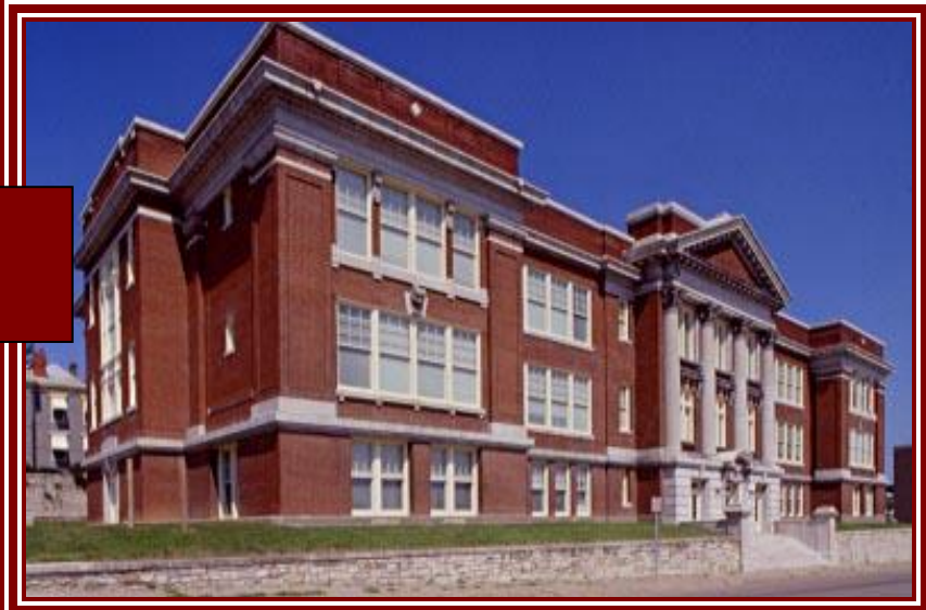
Robidoux School St. Joseph, Missouri