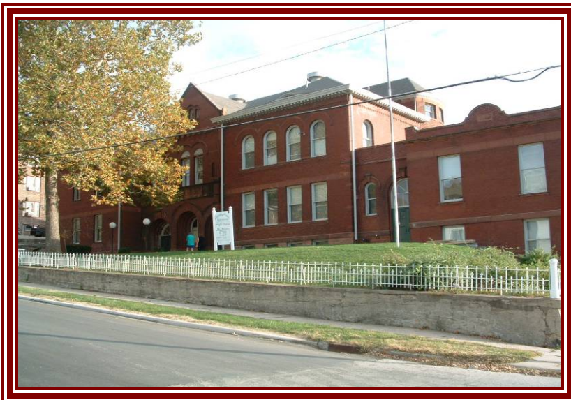
Columbian School Omaha, Nebraska