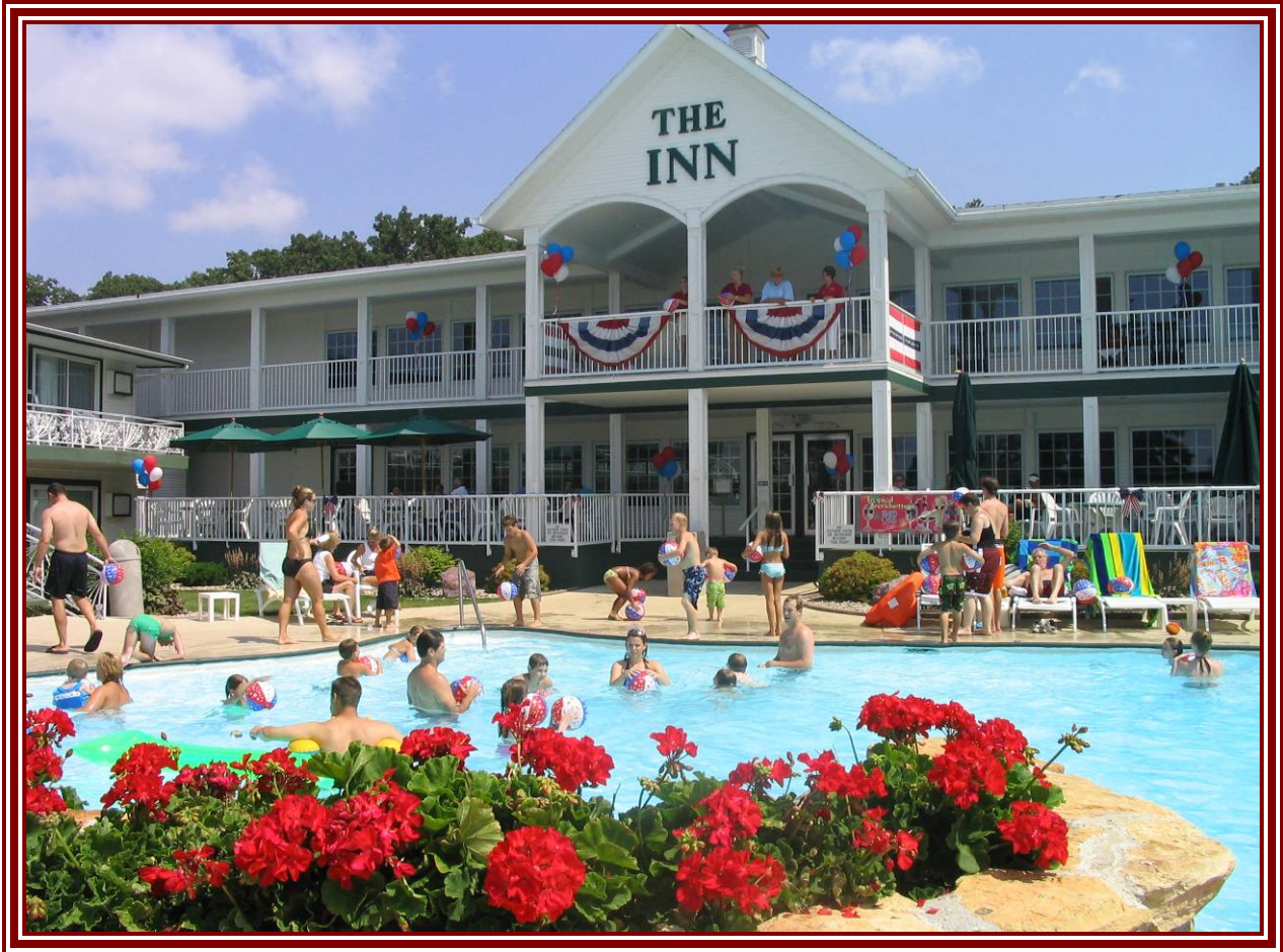
The Inn At Okobojo Okobojo, Iowa