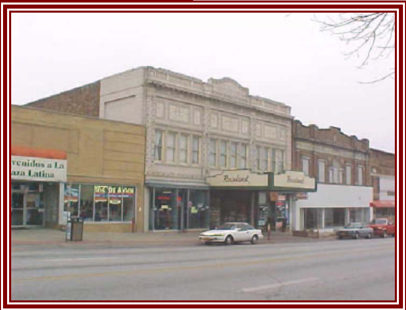
Roseland Theater Omaha, Nebraska