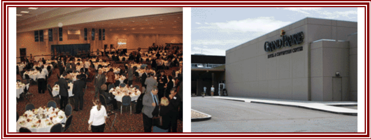
The Grand Prairie Hotel, Convention Center and Kansas Splashdown Waterpark and Grand Slam Sports Bar Hutchinson, Kansas