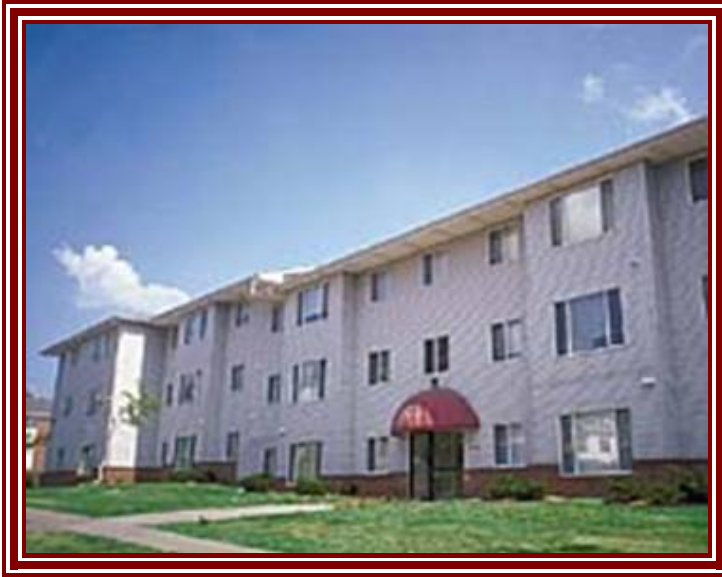
Aspen Ridge Omaha, Nebraska